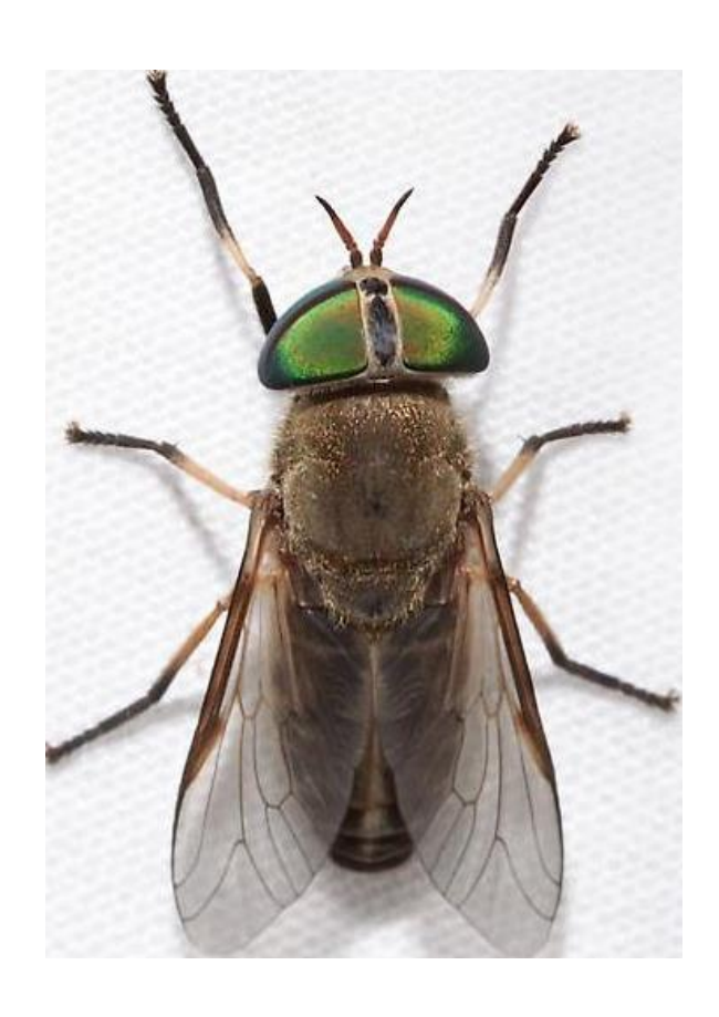
CAPE COD GREENHEAD FLY CONTROL DISTRICT 259 WILLOW STREET YARMOUTH PORT, MA 02675